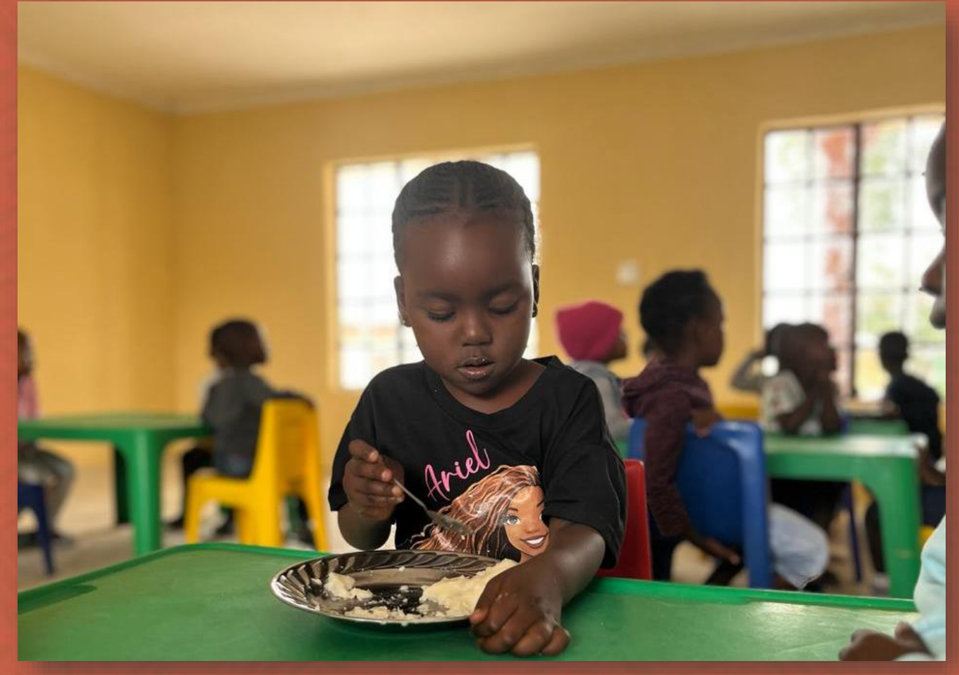
Greater Kruger - Mpumalanga - South Africa